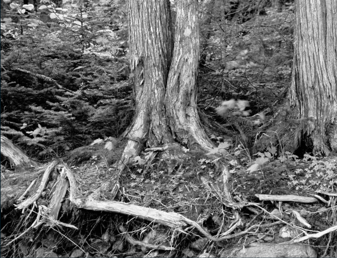
MIRAMICHI RIVER BOREAL FOREST NEW BRUNSWICK THADDEUS HOLOWNIA 2003