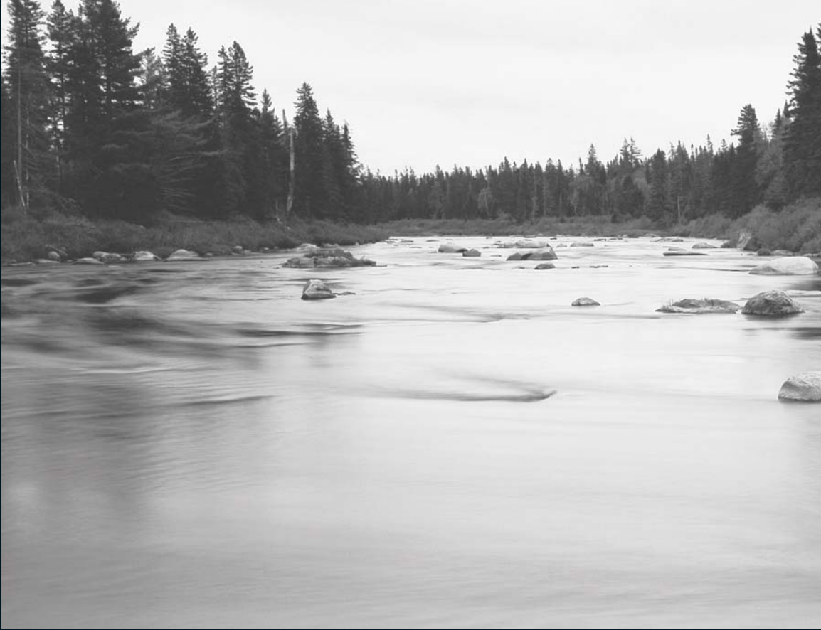
MIRAMICHI RIVER BOREAL FOREST NEW BRUNSWICK THADDEUS HOLOWNIA 2002