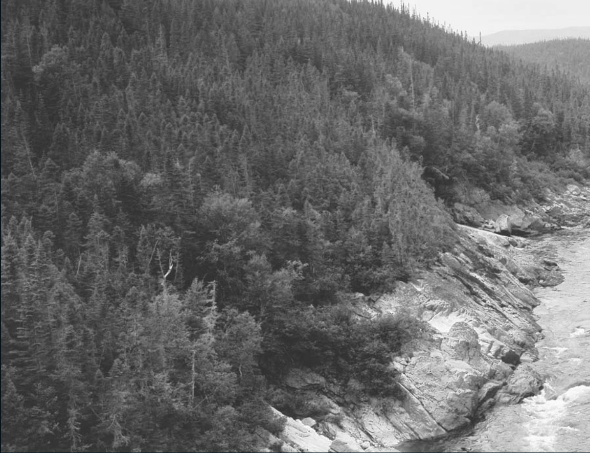
PINWARE RIVER BOREAL FOREST LABRADOR THADDEUS HOLOWNIA 2003