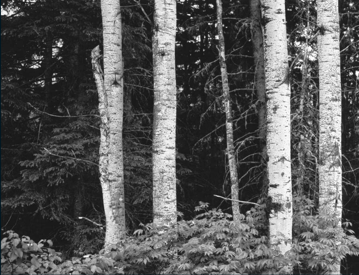
RESTIGOUCHE RIVER BOREAL FOREST QUÉBEC THADDEUS HOLOWNIA 2003